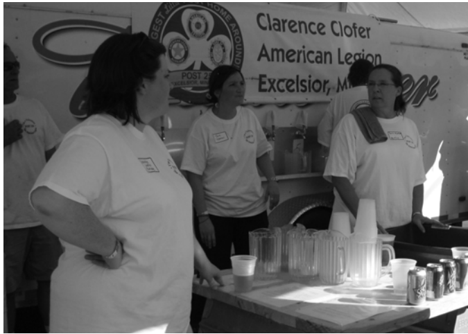
Minnetonka Alumni Party - Beer tent volunteers! Thank you! We earned $4,000 to put towards our programs and projects!