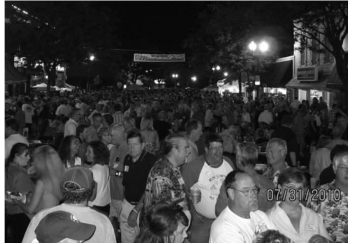
The thirsty crowd!